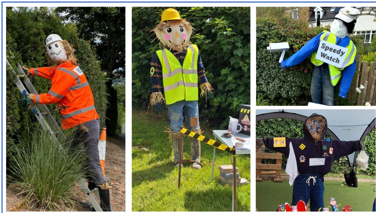
Some of the scarecrows that featured in the Quarndon Events Scarecrow Trail back in July (see page7)

Welcome to the September 2024 Quarndon Newsletter. The Newsletter writing, compiling and editing elves have returned with renewed vigour from our summer break. This Newsletter covers some of what has been going on during those (few) lovely summer days and looks forwards to a bumper crop of local activities in the coming weeks.