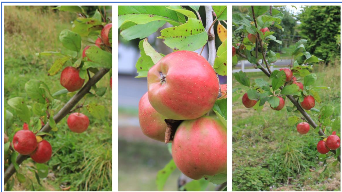
Community Orchard apples – September 2024

We also, once again, have a bumper 'What's On' listing, so have your diaries ready!