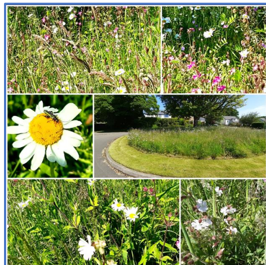
Montpelier Wildflowers, summer 2024

Apart from the benefits of this late cut for pollinators, it also avoids the expense of having to re-seed every year. Year on year different wildflowers become dominant, in response to variations in the weather.