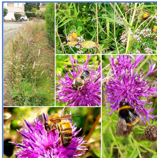
Montpelier Wildflowers, summer 2024

In Quarndon we are doing our bit for biodiversity. Many of you will have noticed the wildflower verges we have established on Montpelier. These have received many accolades when in bloom during the summer. They were seeded with a mix of 27 different annual and perennial wildflowers, (all native species) and are being managed in accordance with this best practice. The longer grass may look untidy for a few weeks, especially after a wet summer, but it is very important not to cut too early.